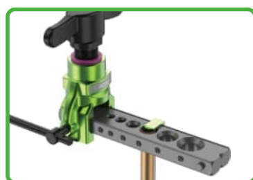
The copper pipe enters the hole, and the limit plate is on the copper pipe