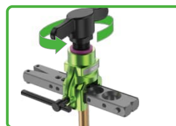
Slide the expanding body to the corresponding hole