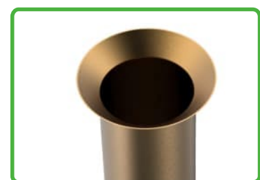
Complete expanding 45° copper pipe