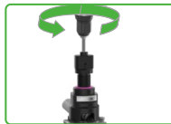
Or use power drive tool for electric flaring