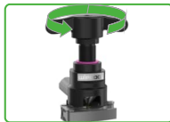
Close the clamp and use the hand for manual flaring