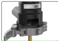
Open the clamp & insert the copper pipe