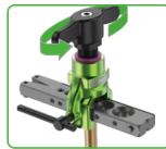
Slide the expanding body to the corresponding hole