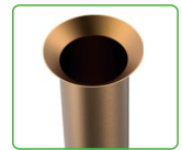
Finalize of expanding 45° copper pipe