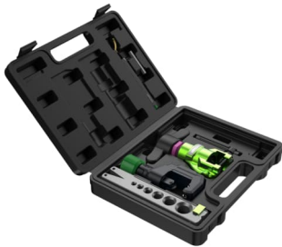
EF-2LK (Tool box with HC-32,HD-1,Hexagon drill bit)