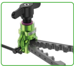
The expansion strip is inserted into the expansion body