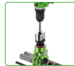
Or use cordless drill for fast flaring