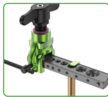
The copper pipe enters the hole, and the limit plate is on the copper pipe