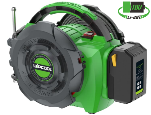
Battery converter (Optional) See P130